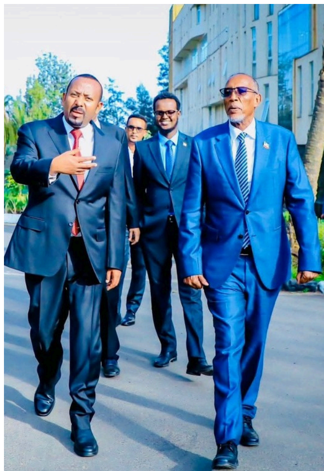
PM Abiy & President Muse Bihi, MoU signing ceremony, 1 Jan 2024.

Despite the high stakes, the new government has not yet disclosed its intentions regarding the MoU, and anticipated state visits between Somaliland and Ethiopia have yet to materialize. This uncertainty has left regional dynamics in a state of flux, with all eyes on how Somaliland and Ethiopia will navigate their relationship moving forward. The new administration faces the delicate task of balancing its strategic interests with the need to manage escalating regional tensions, particularly as Somalia and its allies continue to exert pressure on the international stage.