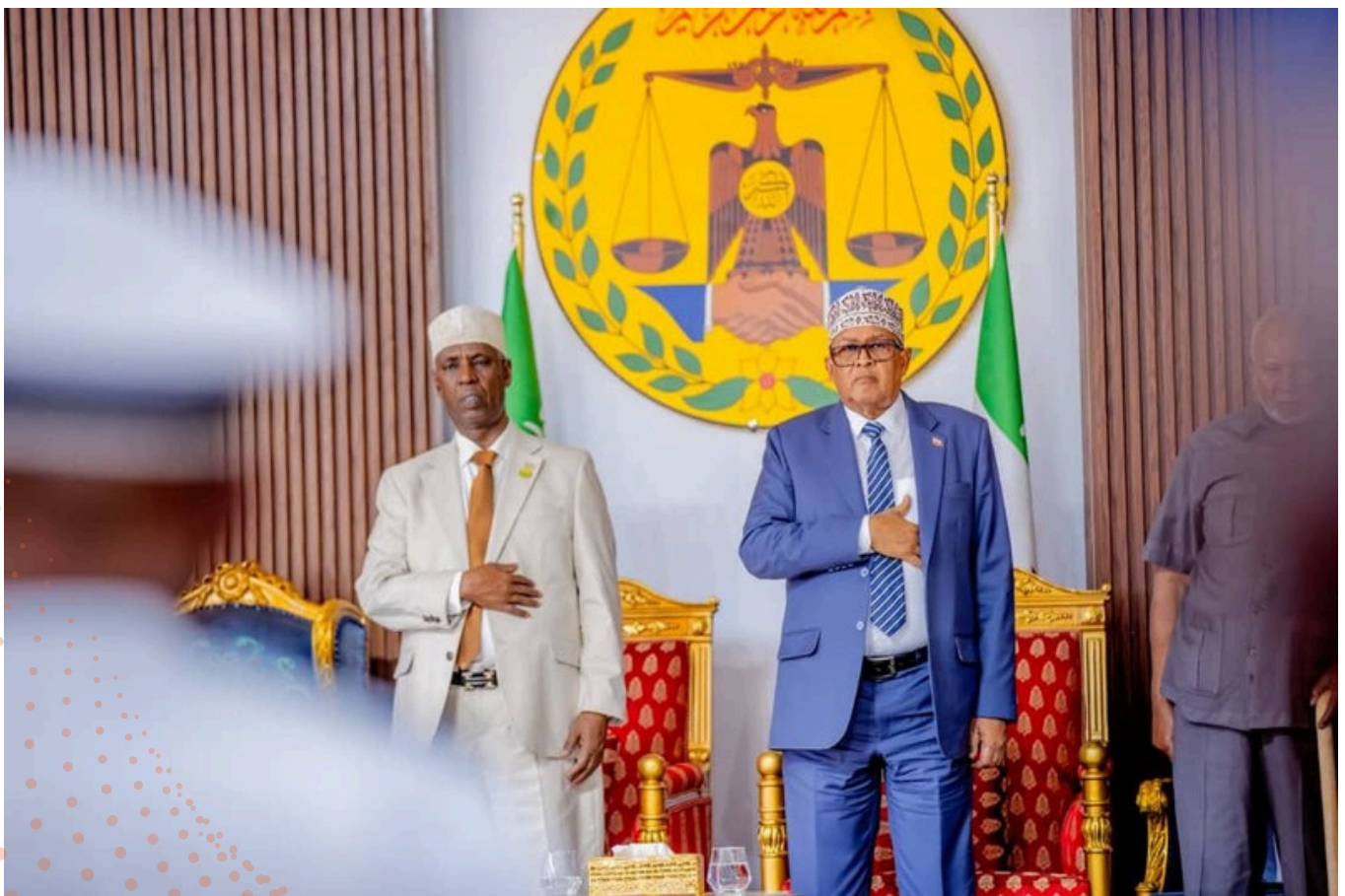
Newly elected President and Vice of Somaliland