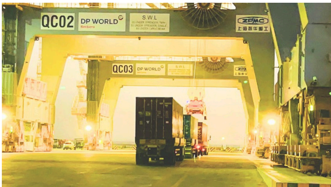
Berbera Port, Somaliland © ARDAA Research Institute

The new government's focus on economic diplomacy reflects a clear understanding of the link between economic development and political legitimacy. Advancing projects like the Berbera Port and the Berbera Corridor, Somaliland is not only boosting its domestic economy but also enhancing its strategic value to regional and global partners. This approach aligns with the broader goal of positioning Somaliland as a stable, investment-friendly destination in a volatile region.